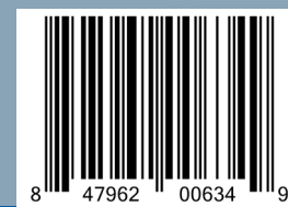
96-267 Scissor Stand