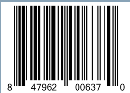
96-014 Folding Stand